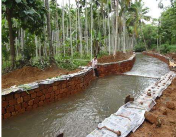
Granite Laterite Retaining Wall