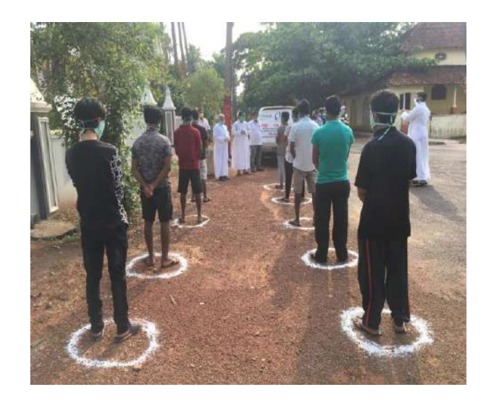
Food kit distribution to migrants