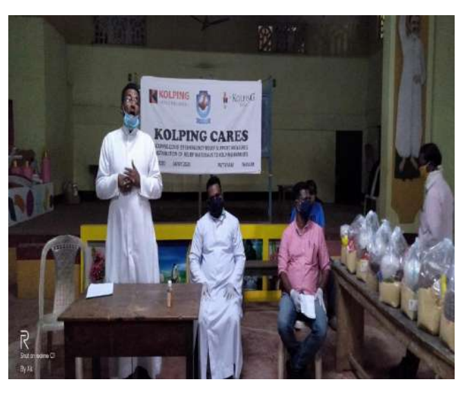
Kolping food kit distribution