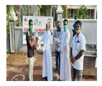
Food kit support to Migrants