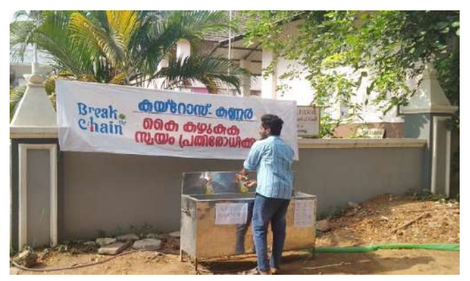
Break the chain Campaign