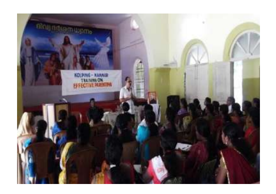
Training on Effective Parenting Program