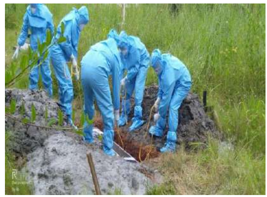
Covid Death Burial