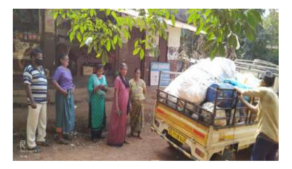
Pariyaram ITC & Mudikkanam Unit